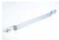
Wall Bracket WALL Zinc plated, 0.8kgs