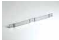
Truck & Float Bracket TKBKT