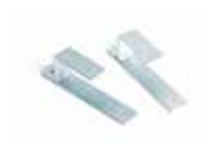
Over Rail Bracket MBORB